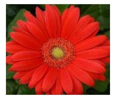
Red with Light Eye