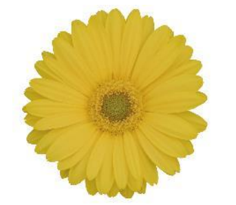
Yellow with Light Eye