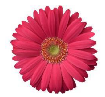
Deep Pink with Light Eye