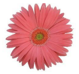
Salmon Shades with Light Eye