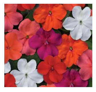
NEW Select Mixture