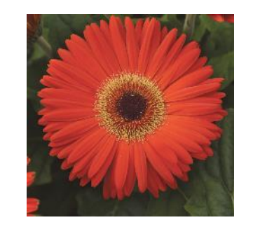
NEW Deep Orange with Dark Eye More compact variety has a good, deep orange colour.