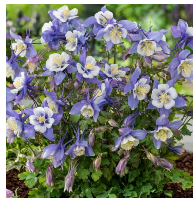
NEW Blue White

Features a slightly more slender plant habit compared to the rest of the series.