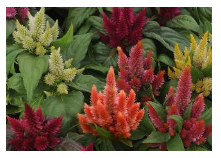
NEW Mixture Improved