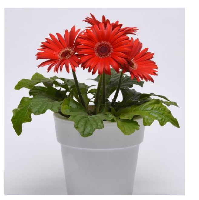
NEW Red with Dark Eye

More uniform in colour and around one week earlier to flower than competing reds.