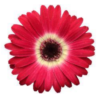
Bicolor Rose White