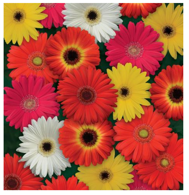
NEW Mixture Improved

Includes all varieties in the series. Note that Bicolor Orange Yellow is slightly later to flower than the rest of the varieties. POT PLANTS