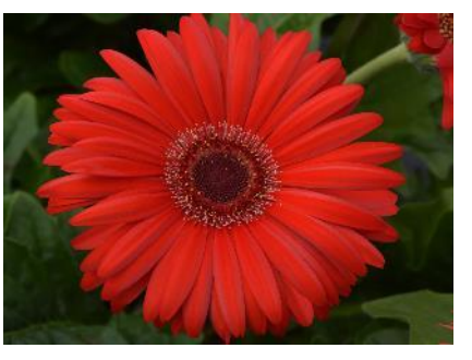
NEW Red with Dark Eye