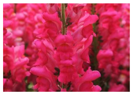
Cherry Rose (3,4)