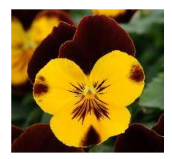
NEW Red Wing Improved