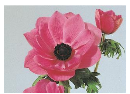
NEW Orchid Shades Improved