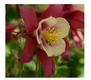
NEW Red Yellow