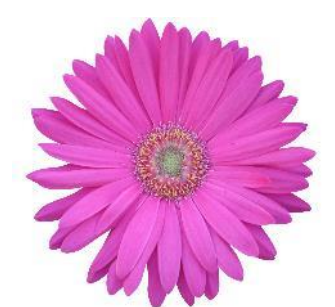
Rose with Light Eye