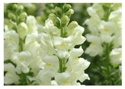
Ivory White (3,4)