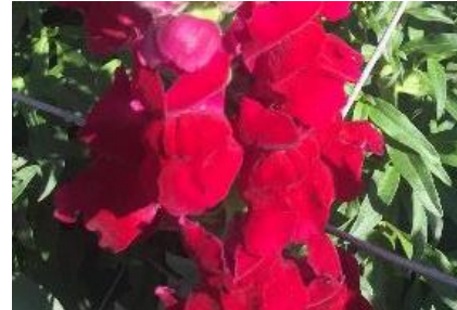
NEW Red Improved (3,4)