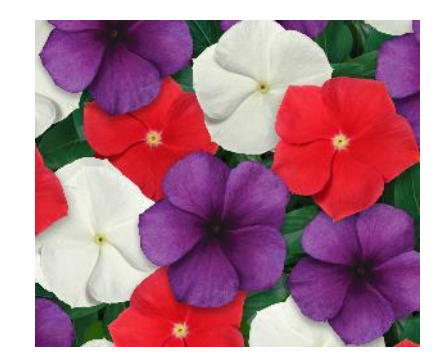
NEW American Pie Mixture