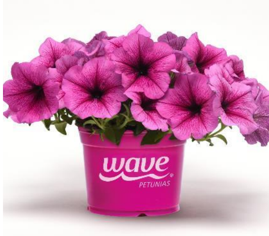
NEW Rose Fusion