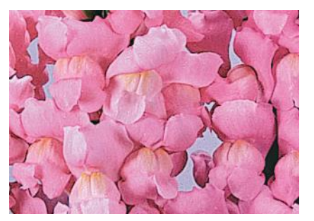
Yosemite Pink (1,2)