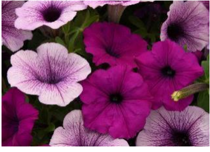
Plum Pudding Mixture