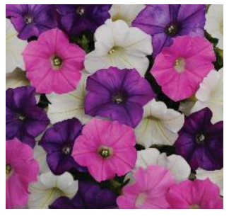
Rose Spark Mixture