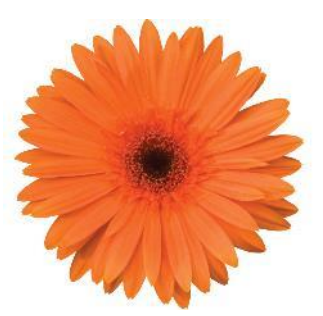
Orange with Dark Eye