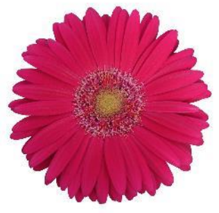
Deep Rose with Light Eye