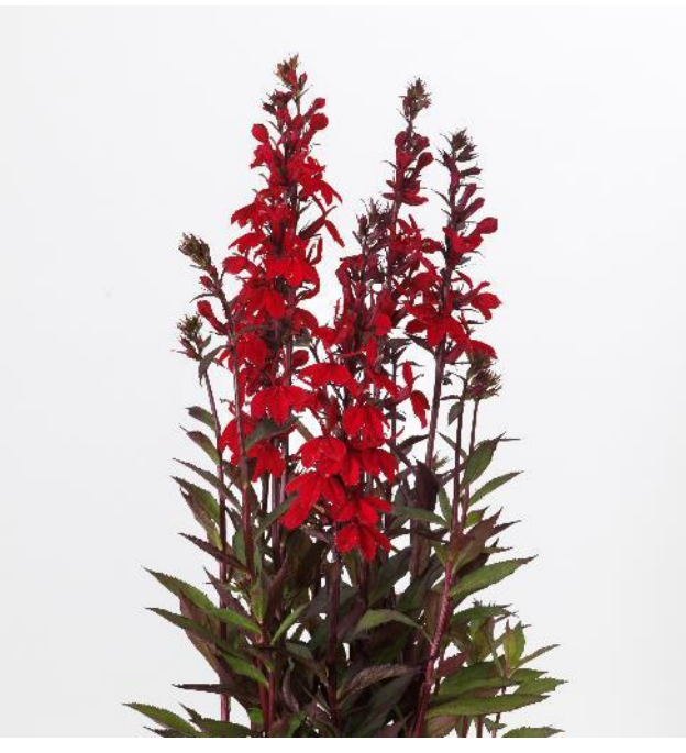
NEW Scarlet Bronze Leaf