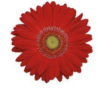
Red with Light Eye