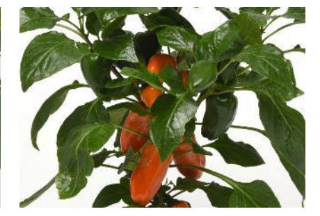
Fresh Bites Orange