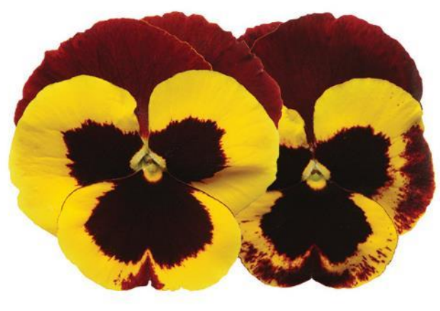
NEW Red Wing Improved: Offers better branching and a more mounding habit.