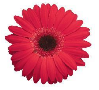
Red with Dark Eye