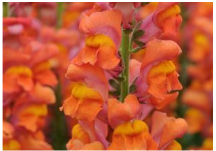
Dark Orange (3,4)