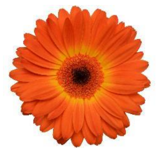
Bicolor Yellow Orange