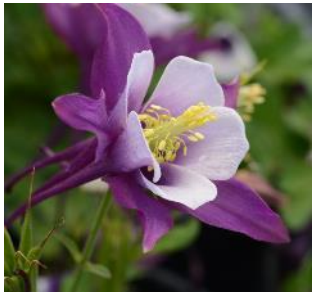
NEW Purple White