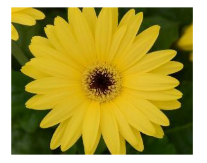
Yellow with Dark Eye