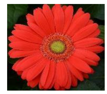
Cherry with Light Eye