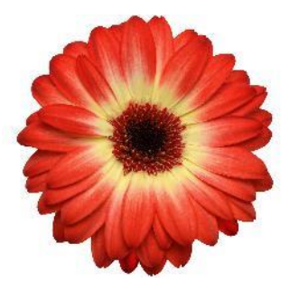
Bicolor Red Lemon