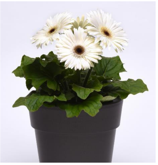
NEW White with Dark Eye Clear white and uniform in colour.

More uniform in colour and around one week earlier to flower than competing reds.