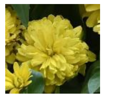
NEW Yellow Improved