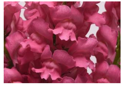
NEW Pink Improved (3,4)