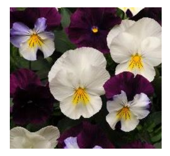
Berries 'N Cream Mixture