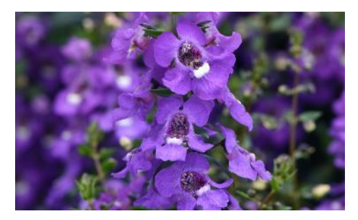
NEW Blue Improved