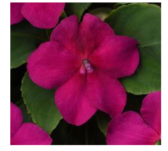
NEW Violet Shades