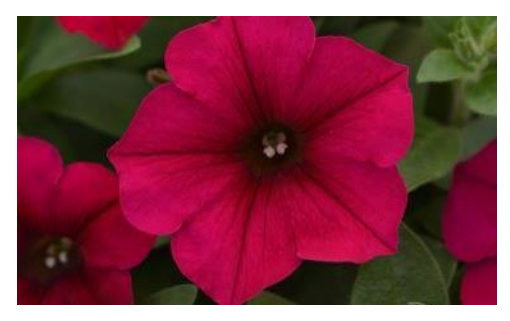
NEW Carmine Velour