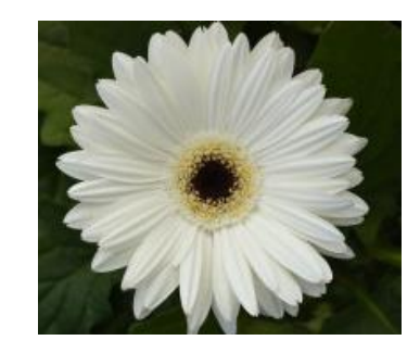
NEW White with Dark Eye