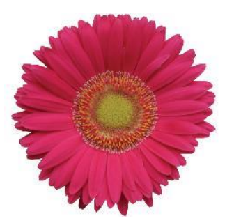
Bright Rose with Light Eye