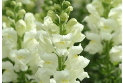
Ivory White (1,2)