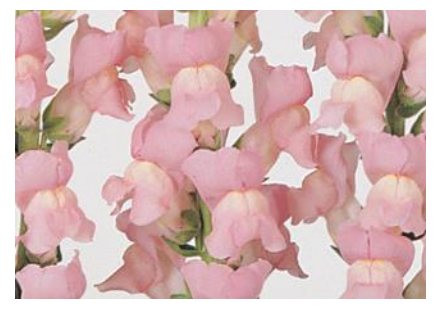
Shell Pink (1,2)