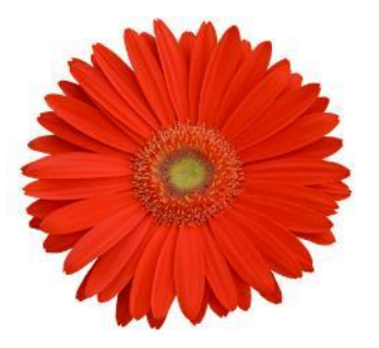
Bright Orange with Light Eye