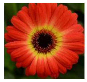
Bicolor Orange Yellow