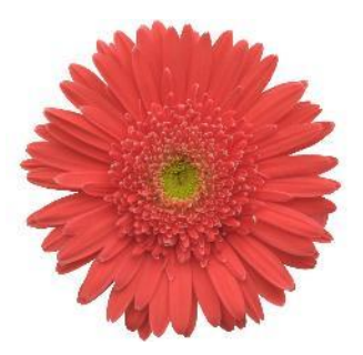
Salmon Rose with Light Eye