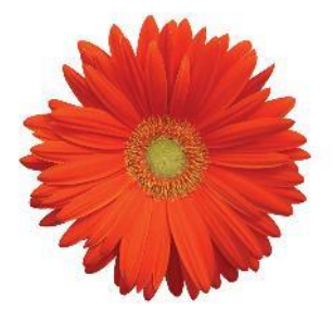
Orange with Light Eye