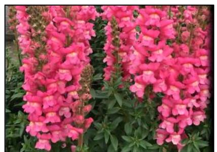
NEW Rose (1,2)