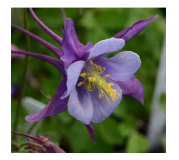
NEW Purple Blue