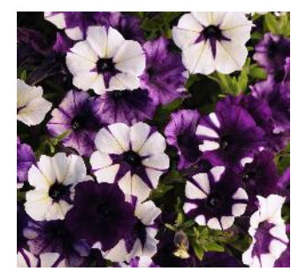
NEW Purple Tie Dye