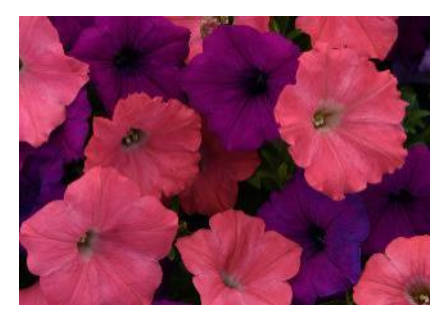
Opposites Attract Mixture