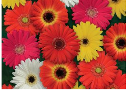
NEW Mixture Improved