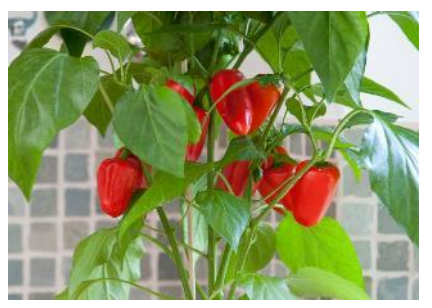
Fresh Bites Red