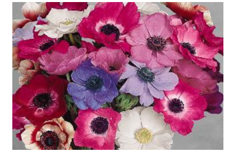
Wine White Bicolor