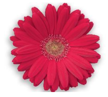
Deep Rose with Light Eye