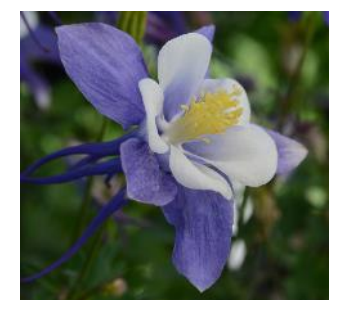
NEW Blue White