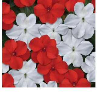
NEW Red White Mixture