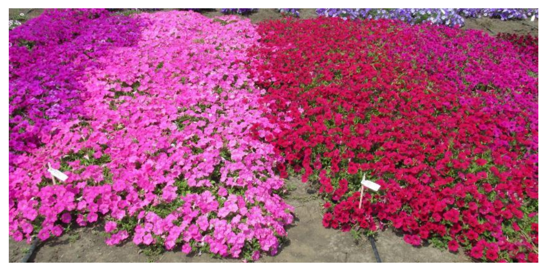
NEW Wave Carmine Velour (R) has the same flat, free-flowering and strong garden performance as Wave Pink (L). Illinois, USA Week 32, 2017

NEW Wave Carmine Velour shows strong garden performance in Illinois, USA Week 30, 2018