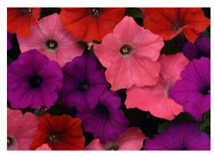
South Beach Mixture