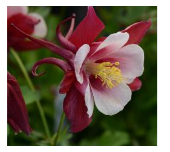
NEW Red White