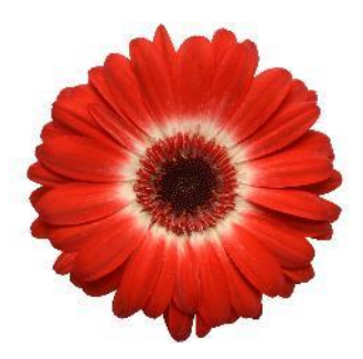
Bicolor Red White