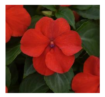
NEW Bright Red