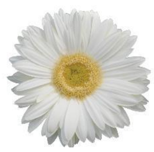
White with Light Eye