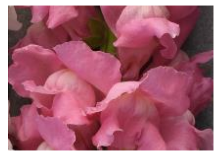
True Pink (1,2)