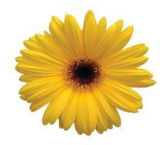
Golden Yellow with Dark Eye