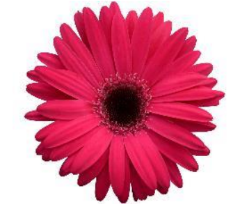
Bright Rose with Dark Eye