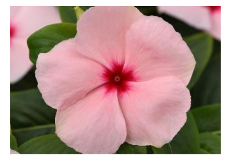
NEW Apricot Improved