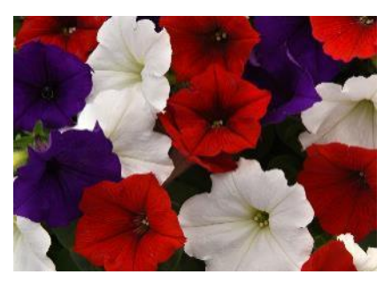
The Flag Mixture