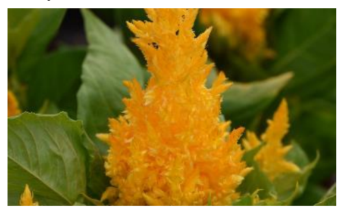
NEW Yellow Improved