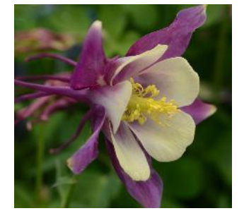
NEW Purple Yellow