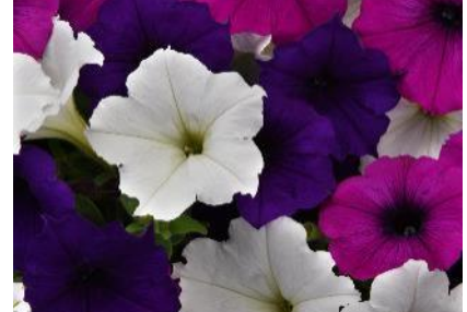
Great Lakes Mixture